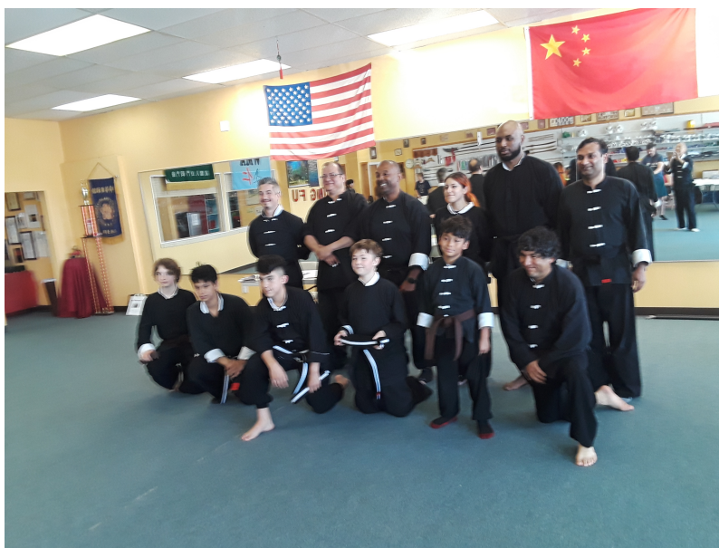
Brown & Black belt rank test on 4/26/2025.

No class on September 1, 2025 (Monday) due to Labor Day.