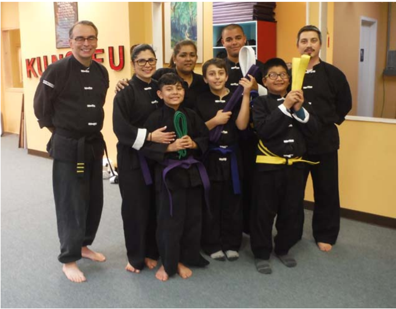
Rank test picture February 25, 2019.