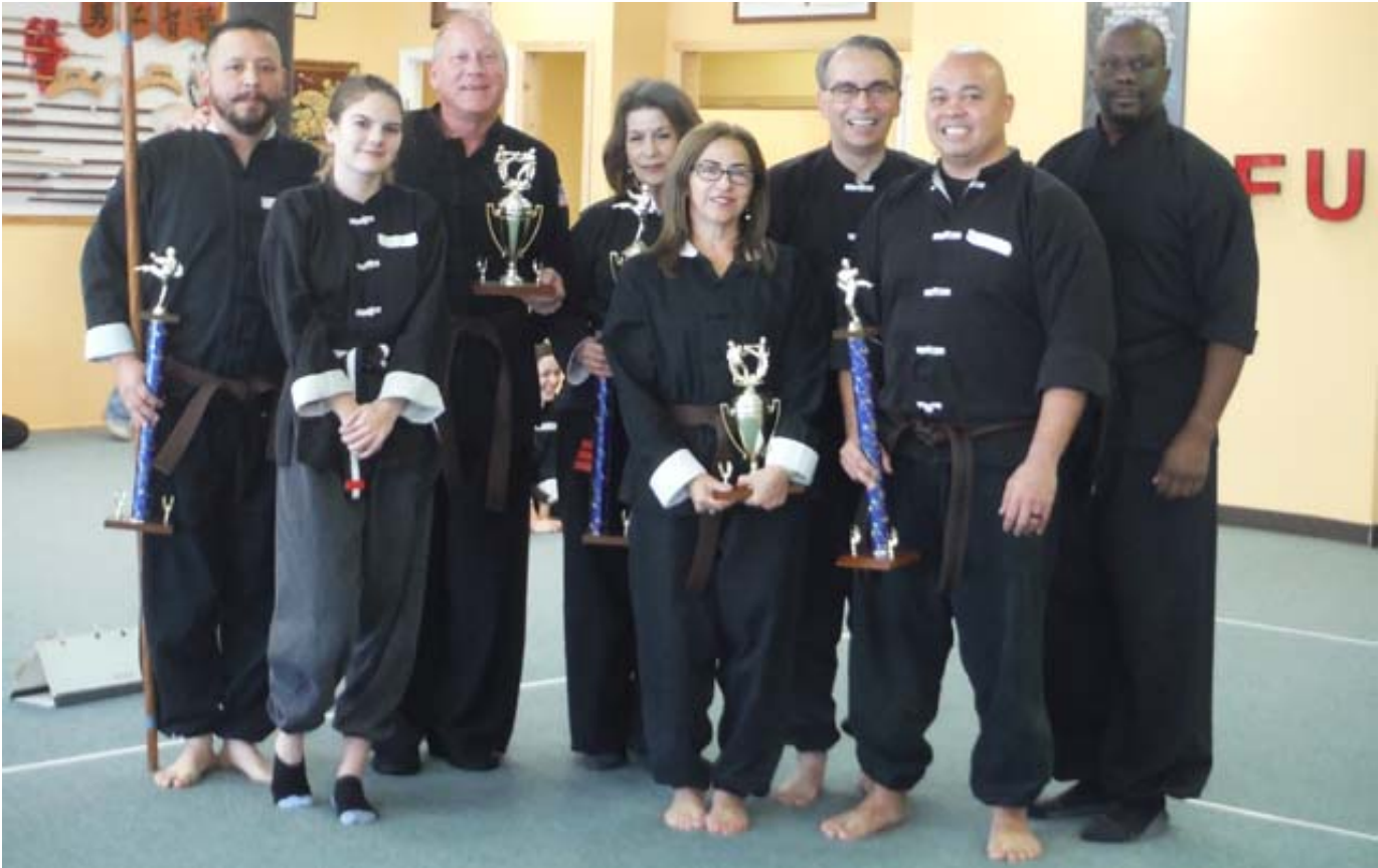
Inner-school Tournament picture on February 23, 2019.