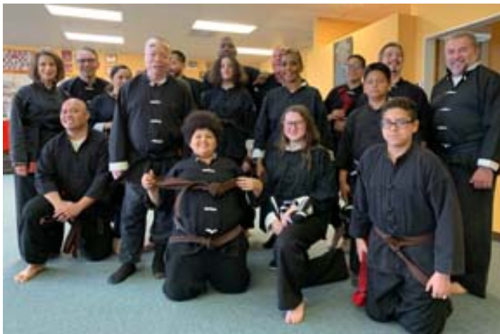
Brown & Black Test picture on April 13, 2019

06/01/2019- Octavia Fields Library Kung Fu Class 06/07/2019-06/28/2019- Advanced Bo Begins 8-9 pm 06/08/2019- Tai Chi Rank Test 06/08/2019- Kung Fu Birthday party 1:30 pm 06/11/2019- Tai Chi make up test 06/14/2019- Guest Instructor 06/17/2019- Women's Self Defense Class 06/24/2019- Accelerated Rank Test 07/04/2019 - 07/06/2019 - NO CLASS DUE TO INDEPENDENCE HOLIDAY.