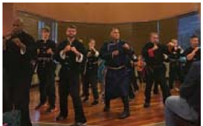
Chinese New Year celebration - February 10, 2018.