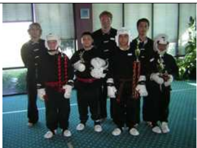
Inner-school tournament on 11/2/13.

Black Belt club & Accelerated program rank test: