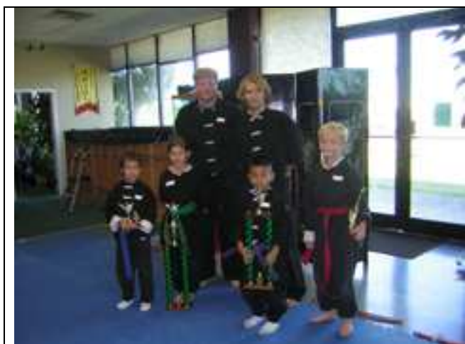
Inner-school tournament on 11/2/13.

" Those who work their land will have abundant food, but those who chase fantasies have no sense."